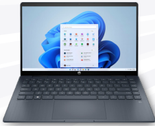
HP PAVILLION LAPTOP Winner