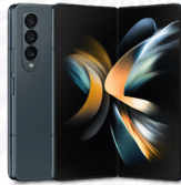
SAMSUNG GALAXY Z FOLD 4 1 st Runner Up