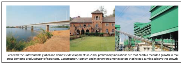
Even with the unfavourable global and domestic developments in 2008, preliminary indications are that Zambia recorded growth in real gross domestic product (GDP) of 6 percent. Construction, tourism and mining were among sectors that helped Zambia achieve this growth